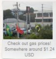
Check out gas prices! Somewhere around $1.24 USD