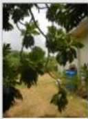
Jamaican backyard AKA I'm a tourist

Off to my very first interview for now though. I'm a little nervous! Wish me luck, man!