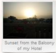
Sunset from the Balcony of my Hotel