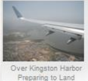
Over Kingston Harbor Preparing to Land

As I leave the airport to catch my JUTA taxi to the hotel, smells of curry and who knows what else permeate the exit from the Manley airport. Turns out there are jerk and curry stands and a Red Stripe bar (hollah!) directly outside the airport! I didn't stop for fear of getting a little too tipsy to adequately find my way to my new home, but there are already plans to hit it up on my way out.