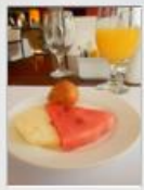
First breakfast and first johnnycake! Yum!

Posted on June 30, 2012 by angelamannboba Edit