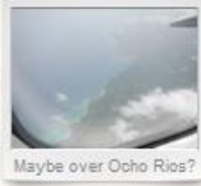
Maybe over Ocho Rios?

Arriving at my layover in Miami and awaiting my flight to Kingston continued to be interesting. As passengers began to fill the gate, I gazed around at who I would be arriving with. I was excited to see what appeared to be a great many deaf individuals at first glance. I thought to myself that it was quite a coincidence a large deaf population was traveling on my same flight to Kingston. Turns out they were just very expressive and communicated a great deal using their hands! (ha! probably could have used some more coffee.) In any case, it was a good first introduction to the culture. As I'm preparing to board, 3 policeman circle a beautiful woman with her child and ask her to come with them to pay for an item she had allegedly shoplifted at a store down the terminal.